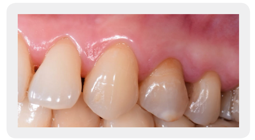
Figure 2b: Pictures after treatment with placebo. Gingival tissue appears pink without edema.